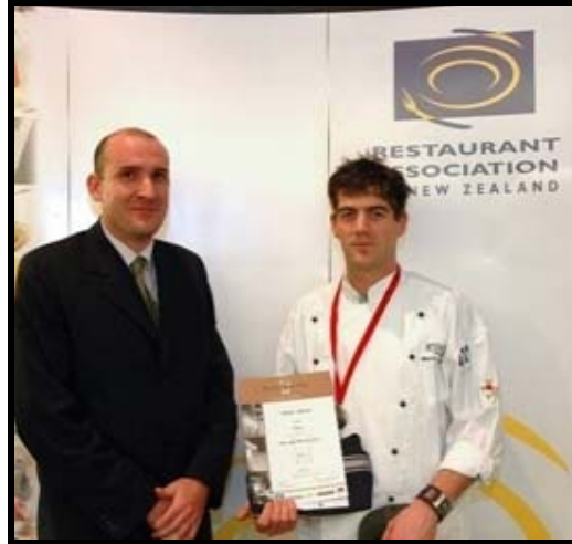
Figure 2: Moffat & Sullivan